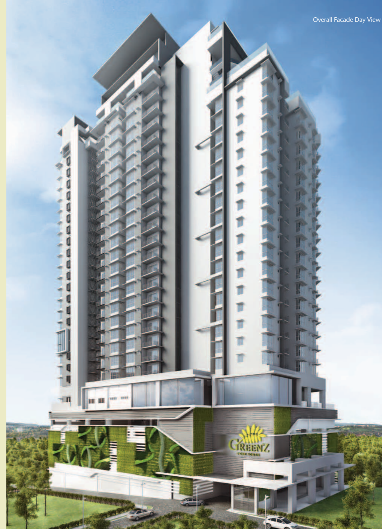
Overall Facade Day View