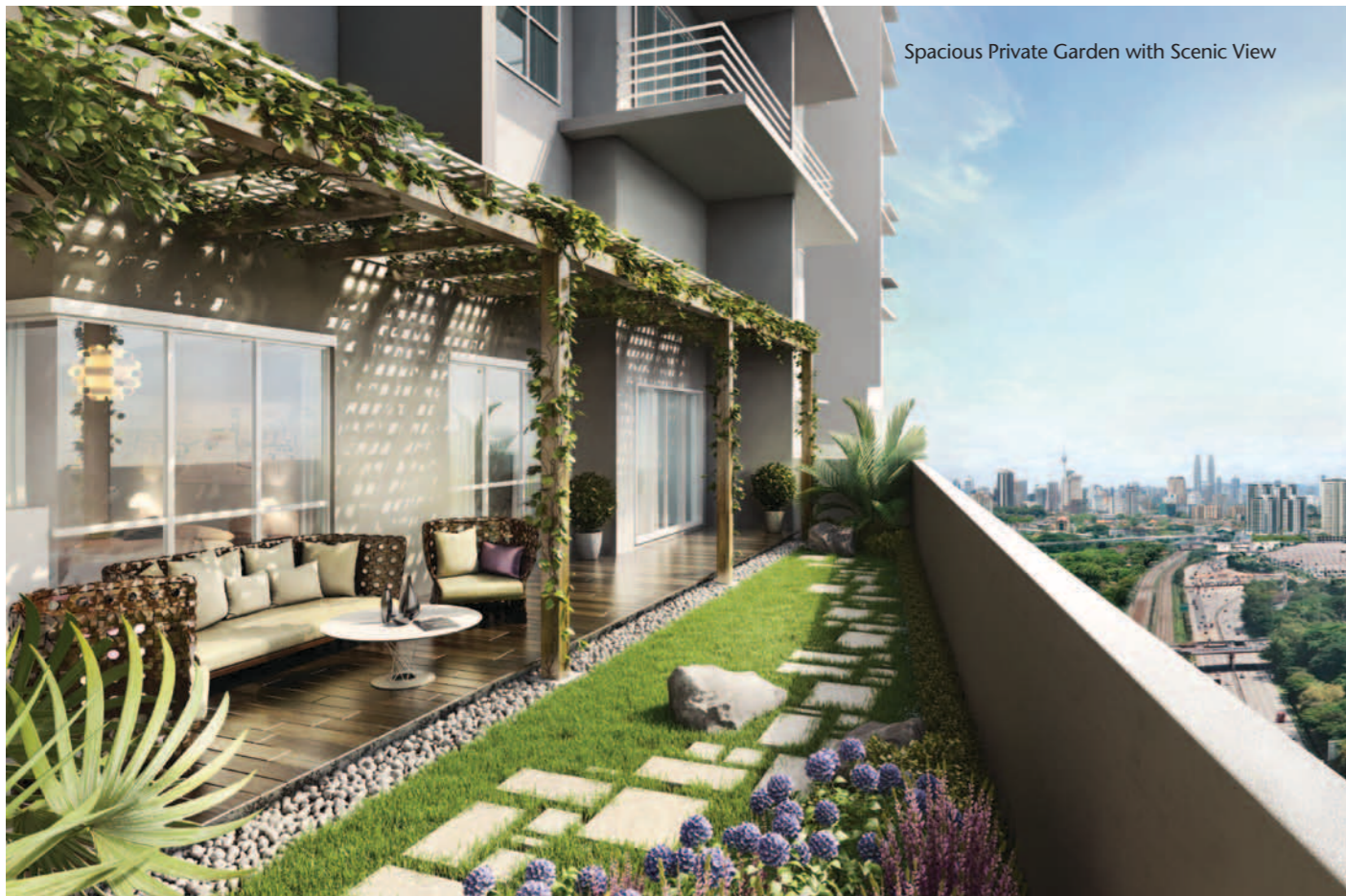
Spacious Private Garden with Scenic View