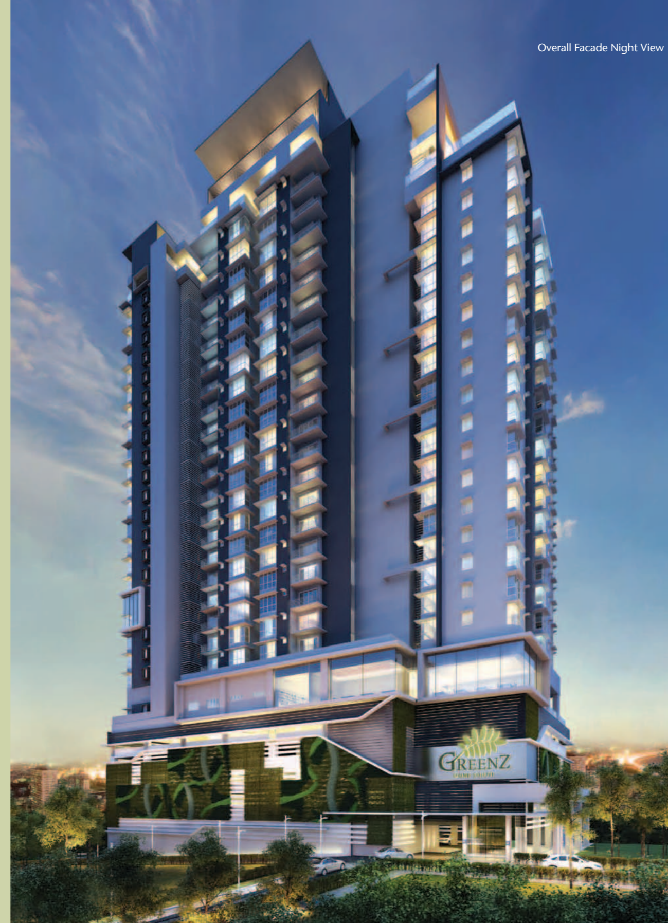
Overall Facade Night View

Nurtured by Nature. Perfected by Design.