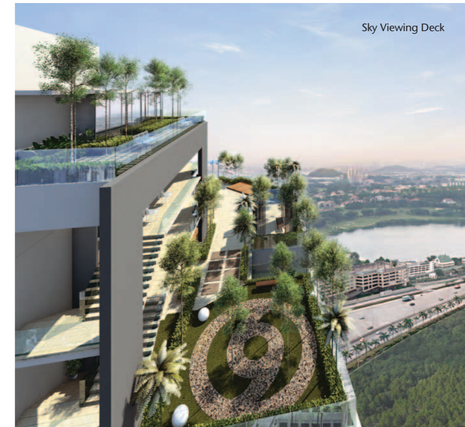
Sky Viewing Deck