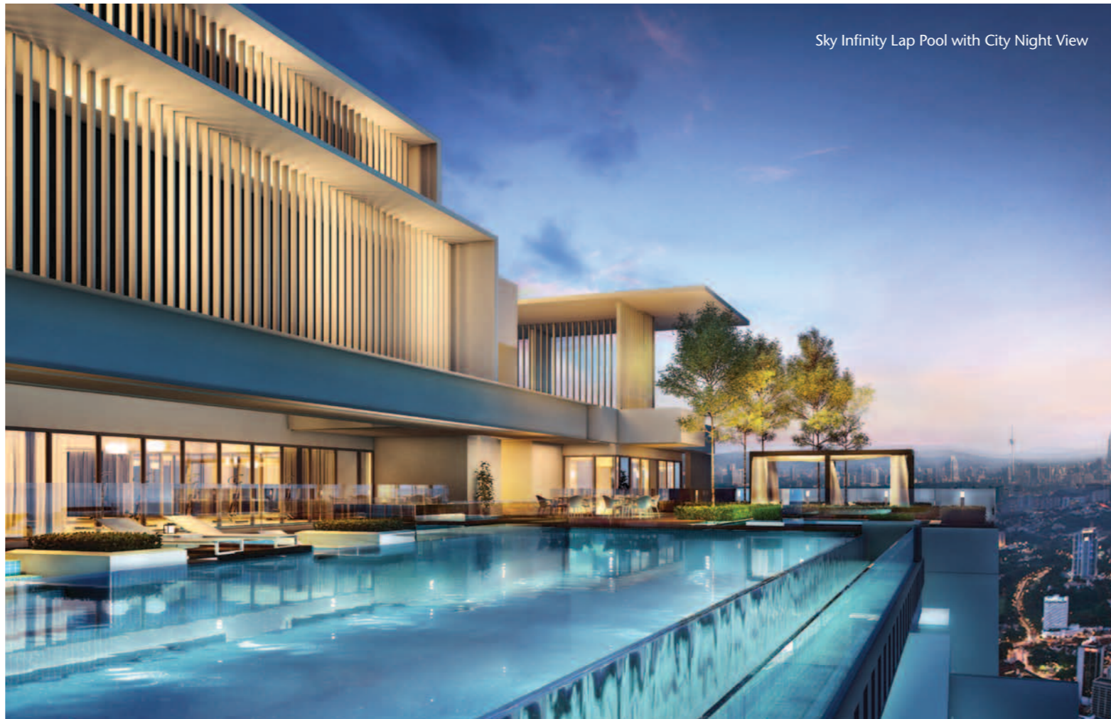
Sky Infinity Lap Pool with City Night View

Furnished with a comprehensive range of facilities, Greenz offers the full pleasures of modernity to embrace your desired lifestyle. Start your day with a pleasant swim or rejuvenating workout, before immersing in scenic vistas at the 24-storey-high Sky Park.