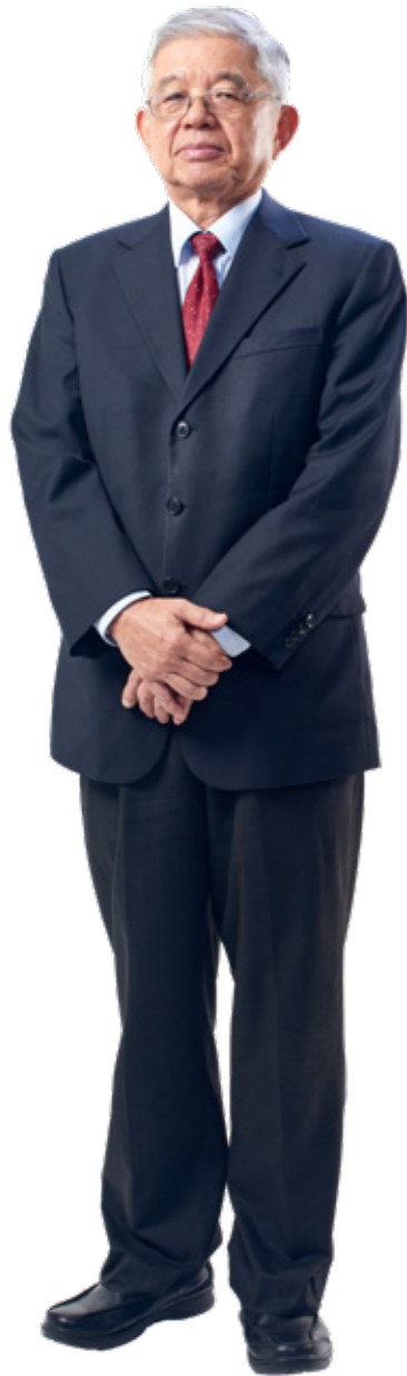
Tan Sri Dato' Seri Dr. Ting Chew Peh Aged 77, Malaysian, Male