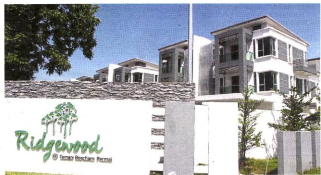
The company's Ridgewood project in Ipoh. Hua Yang aims to expand its landbank.