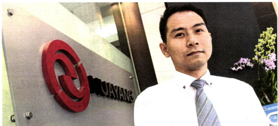
Ho: 'Demand is expected to outstrip supply.'

Basic earnings per share dropped to 11.42