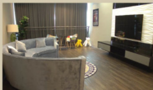
Residence Entertainment Zone